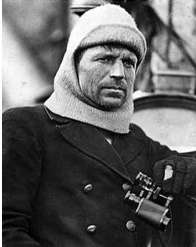
Frank A. Worsley 1872-1943 Captain of the Endurance

“Providence had certainly looked after us. Three or four weeks afterwards Sir Ernest and I, comparing notes, found that we each had a strange feeling that there had been a fourth in our party, and Crean afterwards confessed to the same feeling.”