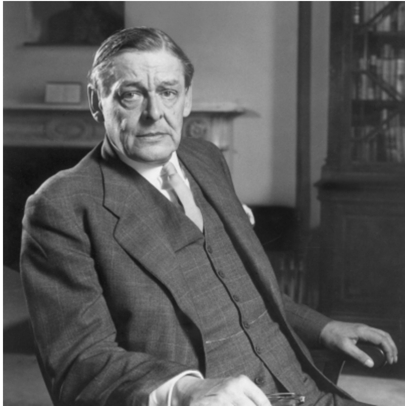
T.S. Eliot 1888-1965

Who is the third who walks always beside you? When I count, there are only you and I together But when I look ahead up the white road There is always another one walking beside you. Gliding wrapt in a brown mantle, hooded I do not know whether a man or a woman - But who is that on the other side of you?