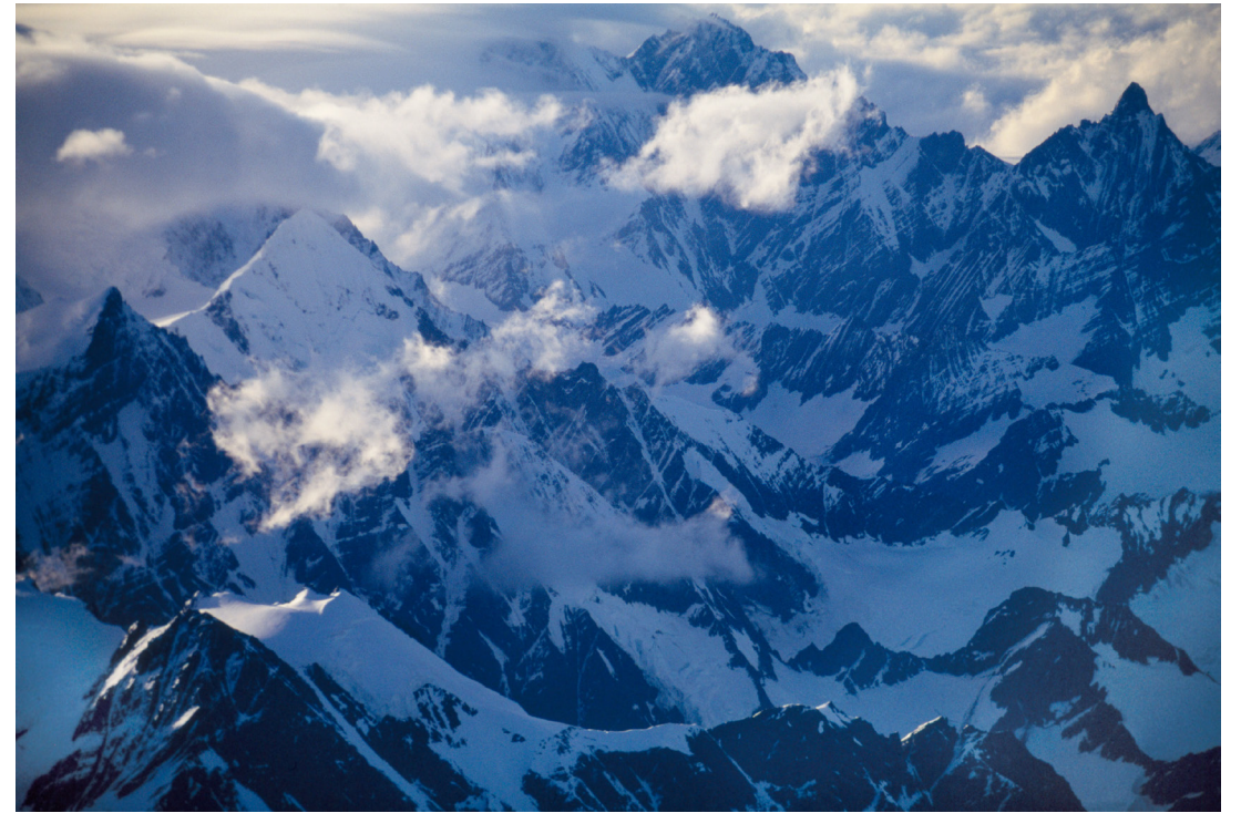
The Interior of South Georgia Island

Alfred Lansing (1921-1975), the American journalist who published his bestselling book Endurance: Shackleton's Incredible Voyage in 1959, recorded that "the interior of the island has been described by one expert as 'a saw-tooth thrust through the tortured upheaval of mountain and glacier that falls in chaos to the northern sea.' In short, it was impassible."