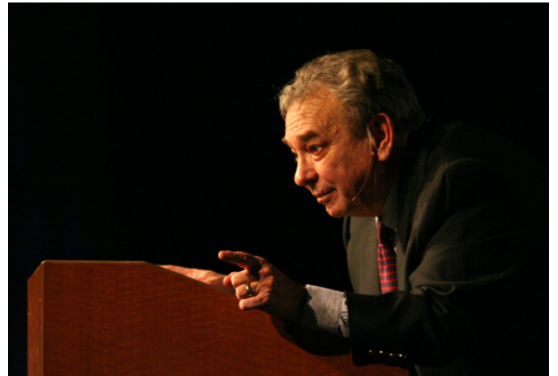
R. C. Sproul 1939-2017

“If we understand the providence of God and love the God of providence, we are able to worship Him with the sacrifice of praise He inherently deserves when things occur that bring pain, sorrow, and affliction into our lives. This understanding of providence is vital to all who would worship God. It is a worship of faith that is rooted in trust.”