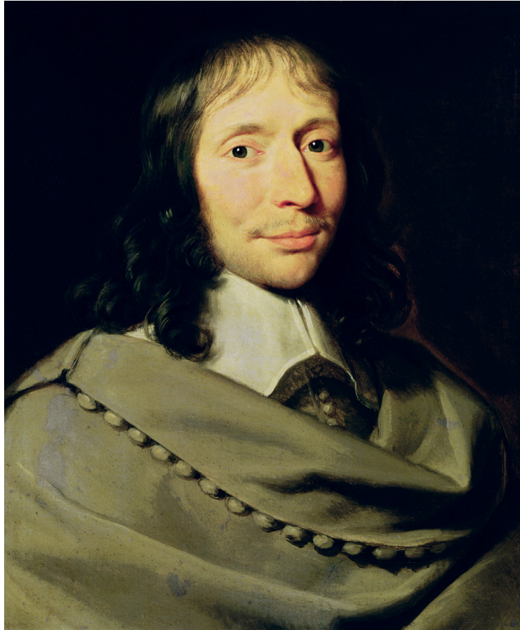
Blaise Pascal 1623-1662

“Everything that is incomprehensible does not cease to exist.”