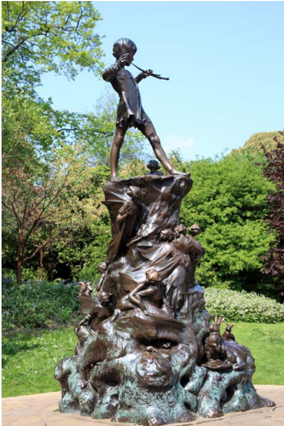
The Peter Pan Statue Kensington Gardens, London Erected April 30, 1912

“The children often spent long summer days on this lagoon, swimming or floating most of the time, playing the mermaid games in the water, and so forth. You must not think from this that the mermaids were on friendly terms with them: on the contrary, it was among Wendy's lasting regrets that all the time she was on the island she never had a civil word from one of them.”