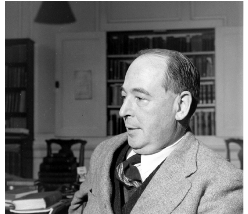
C.S. Lewis 1898-1963

“No, my change of address does not imply retirement – or at least retirement from academic life; what has happened is that Cambridge has given me a Professorship. In many ways I regretted leaving Magdalen, but after nearly thirty years of the tutorial grind, I shall appreciate the less strenuous life of a ‘Chair’ at Cambridge.” I am now settling in there, and think I shall be happy: many of my colleagues are Christians, more than was the case in my old College.”