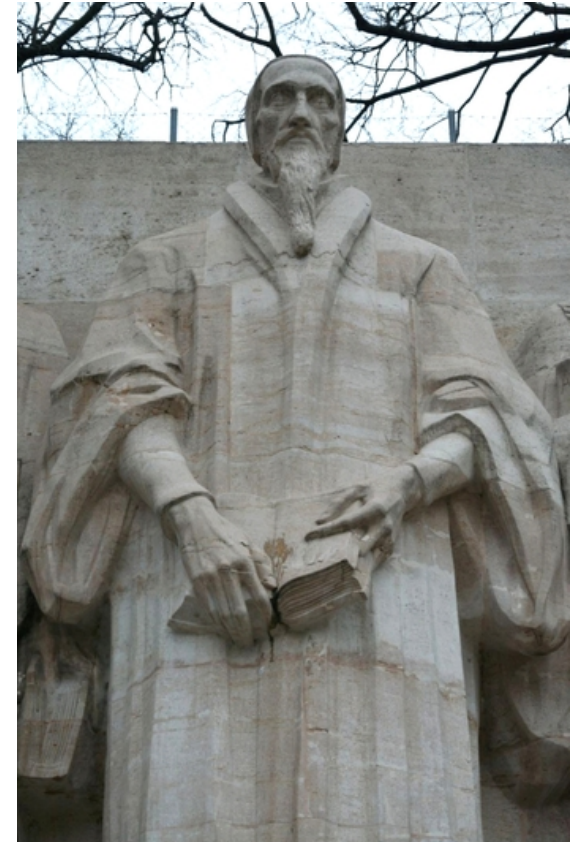
John Calvin 1509-1564

“It means that God is so well-inclined and so ready to give that He will refuse none, none will be snubbed off.” The second word was added, Calvin suggested, “in case a man should fear that he is approaching God too often....He is prepared to heap new benefits on top of the old, with neither limit nor calculation.”