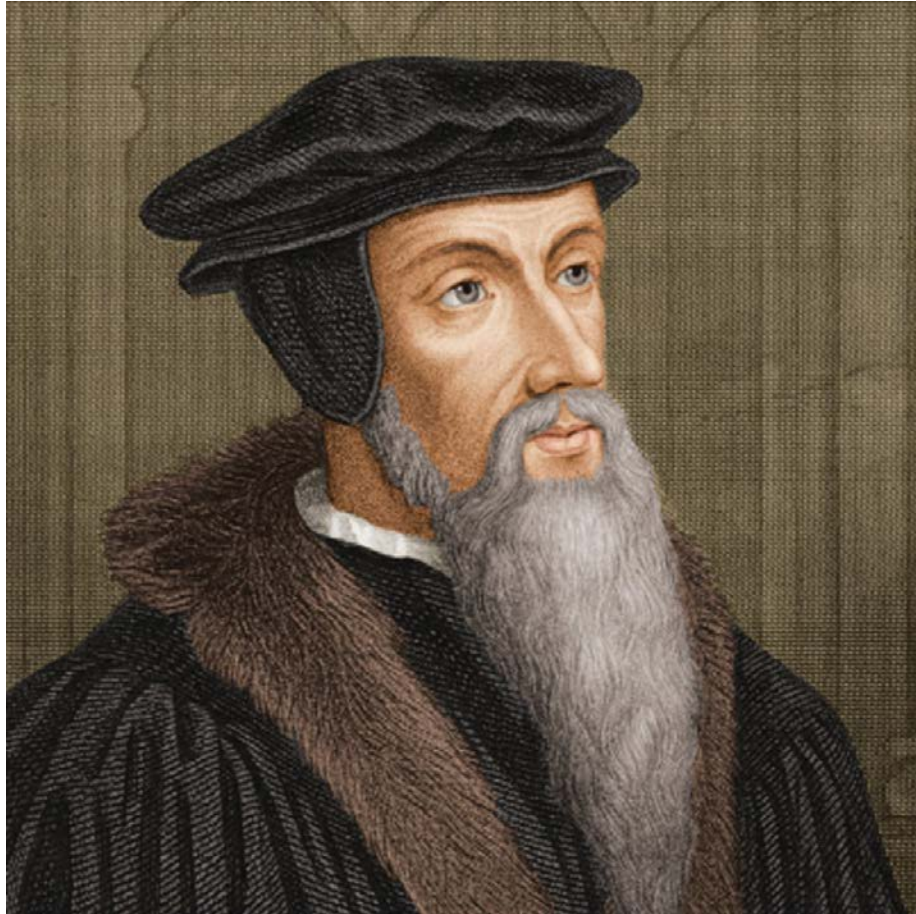
John Calvin 1509-1564

“Our reason, and indeed all our senses, find it strange that we should think ourselves blessed in time of woe, and so we are told to ask the Lord to bring us this wisdom.”