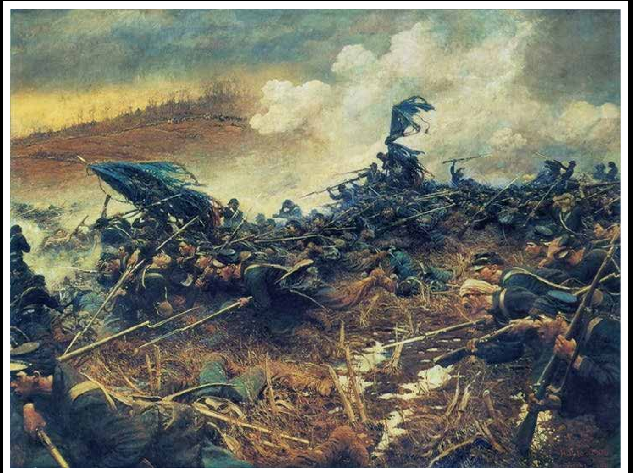
HOWARD PYLE, FATHER OF AMERICAN ILLUSTRATION