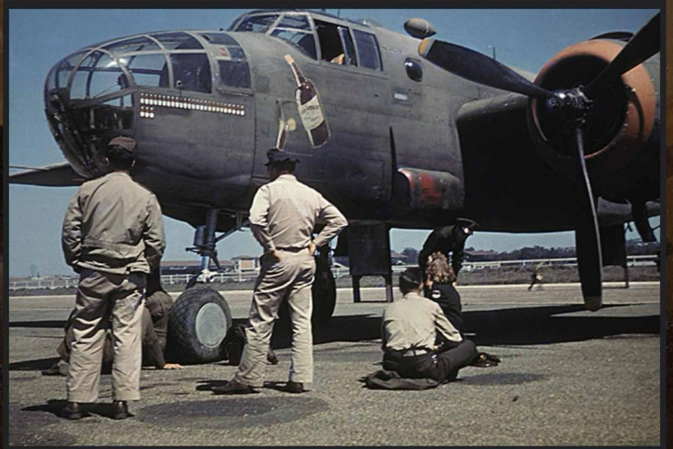
B-25 Mitchell WW2