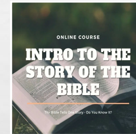
Story of the Bible Course