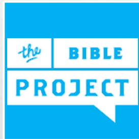
The Bible Project