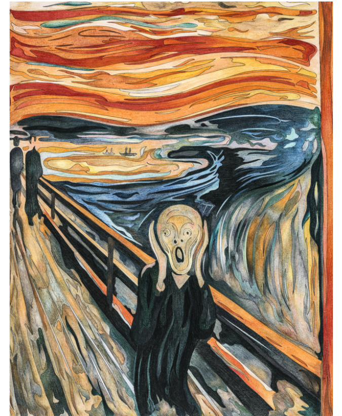
Edvard Munch The Scream 1893