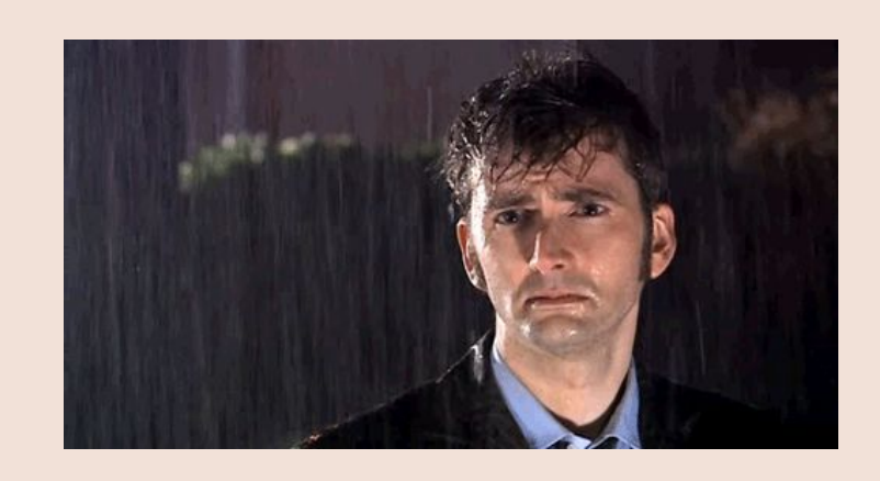
Burdensome, not excited

How do you feel about personally keeping the law?