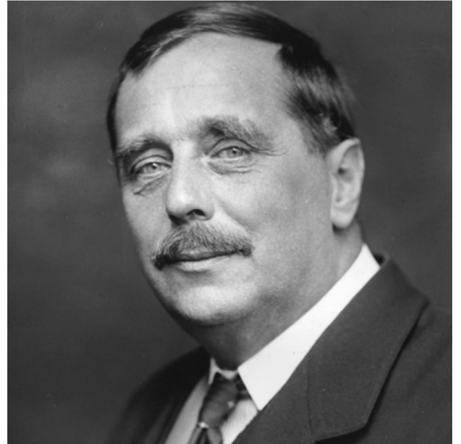
H.G. Wells 1866 - 1946

On his sixty-fifth birthday, H.G. Wells said, "I am sixty-five, and I am lonely and have never found peace."