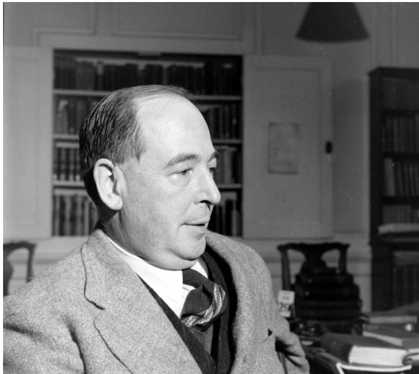
C.S. Lewis 1898-1963

“Of course war is entertaining. The immediate fear and suffering of the humans is a legitimate and pleasing refreshment for our myriads of toiling workers . But what permanent good does it do us unless we make use of it for bringing souls to Our Father Below?”