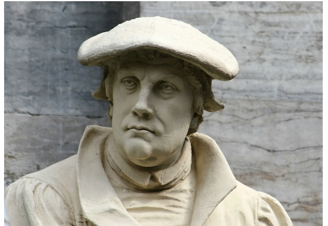
Martin Luther 1483-1546