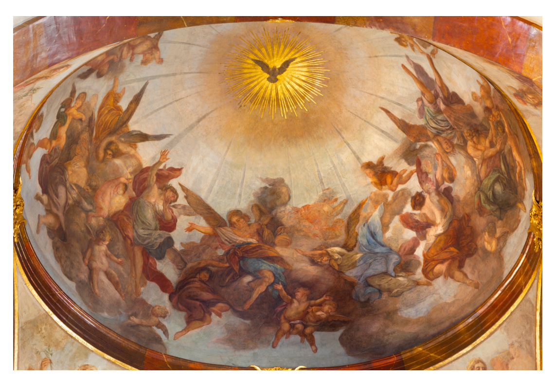
Fresco of the Holy Spirit Among the Angels St. Francis of Assisi Church Prague, Czech Republic