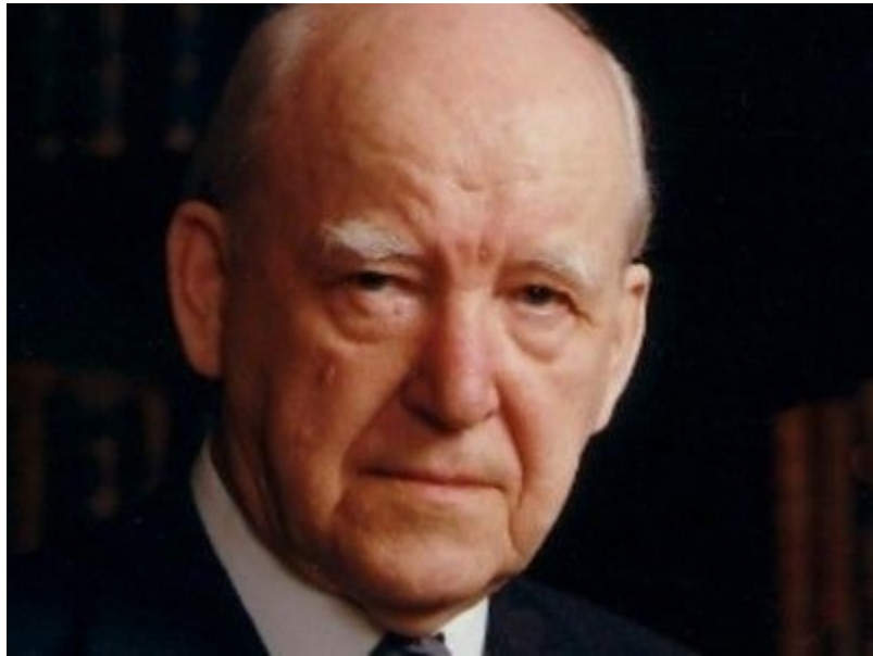
Martyn Lloyd-Jones 1899-1981

“By ‘boldly’ the Apostle means freely, frankly, that nothing be kept back....Pray, says Paul, that I may be delivered from qualifying the gospel, and my statement of it, by carefulness and by endless modifications dictated by concern for my own reputation or my own personal safety.”