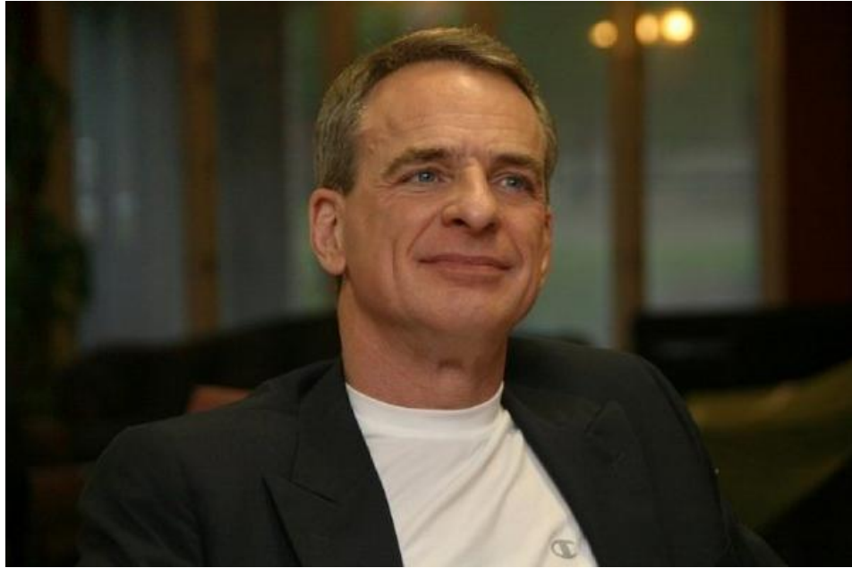
William Lane Craig

Philosopher, Theologian, Historian, Apologist University of Birmingham, PhD University of Munich, DPhil