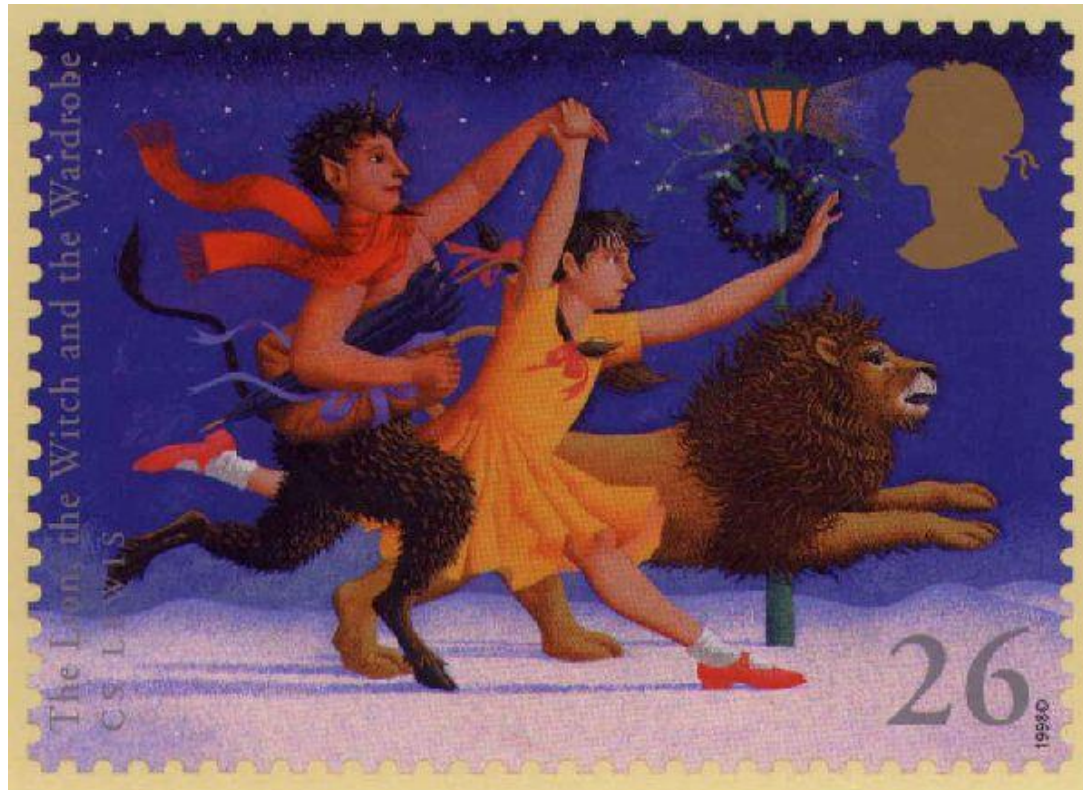
C.S. Lewis Centennial Stamp Oxford Royal Mail Launch 21 July 1998

“When I started The Lion, Witch and Wardrobe I don’t think I foresaw what Aslan was going to do and suffer. I think He just insisted on behaving in His own way. This of course I did understand and the whole series became Christian.”