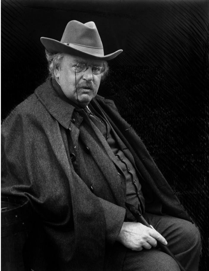
G.K. Chesterton 1874-1936

“I did try to found a heresy of my own; and when I had put the last touches to it, I discovered that it was orthodoxy.”