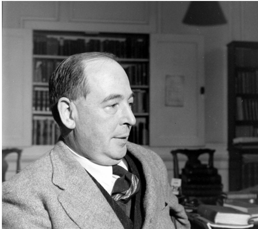
C.S. Lewis 1898-1963

“We are faced, then, with a frightening alternative. This man we are talking about either was (and is) just what He said or else a lunatic, or something worse. Now it seems to me obvious that He was neither a lunatic nor a fiend: and consequently, however strange or terrifying or unlikely it may seem, I have to accept the view that He was and is God. God has landed on this enemy-occupied world in human form.”