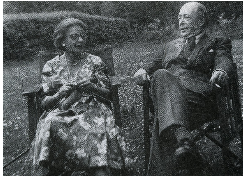
C.S. Lewis with his wife, Joy

“And now, what was the purpose of it all? What did He come to do? Well, to teach, of course; but as soon as you look into the New Testament or any other Christian writing you will find they are constantly talking about something different – about His death and His coming to life again. It is obvious that Christians think the chief point of the story lies here.”