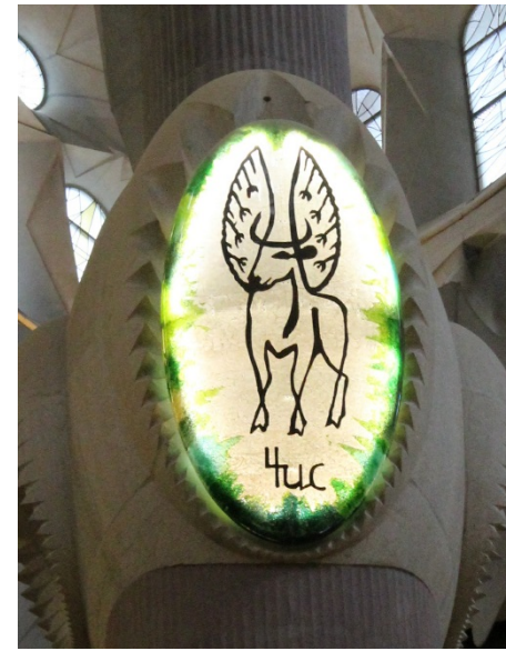
Luke A Winged Ox