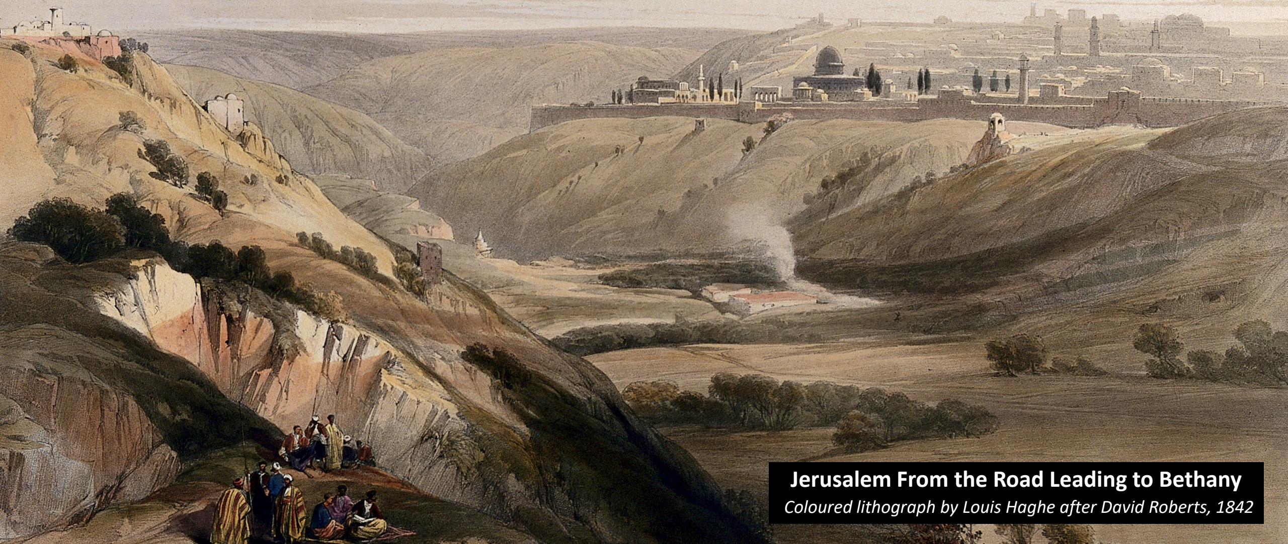
Jerusalem From the Road Leading to Bethany Coloured lithograph by Louis Haghe after David Roberts, 1842