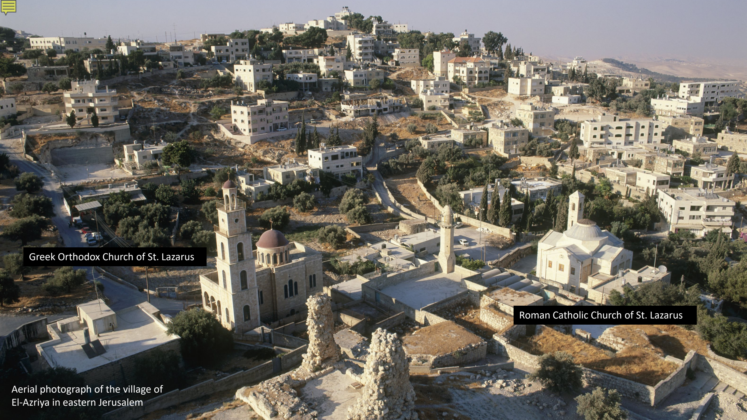
Greek Orthodox Church of St. Lazarus