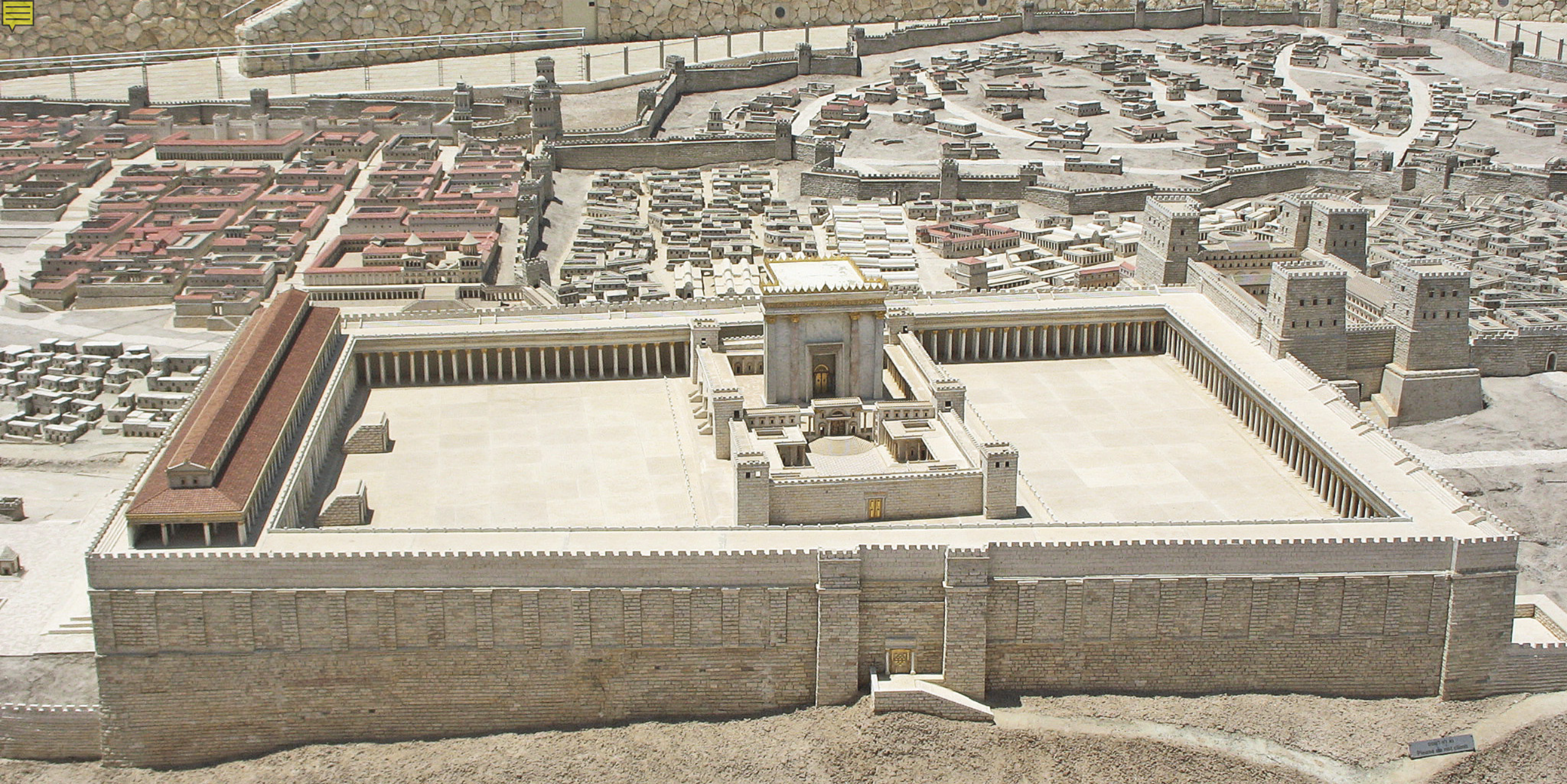
Second Temple: Herod the Great