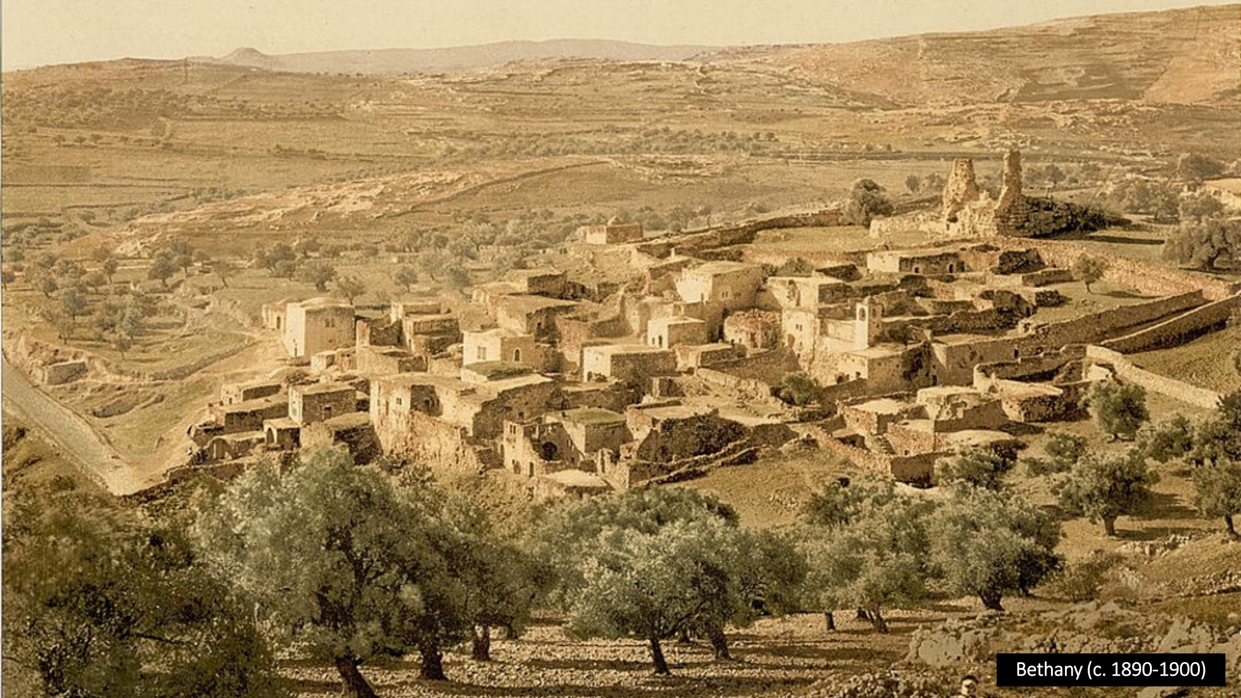
Bethany (c. 1890-1900)