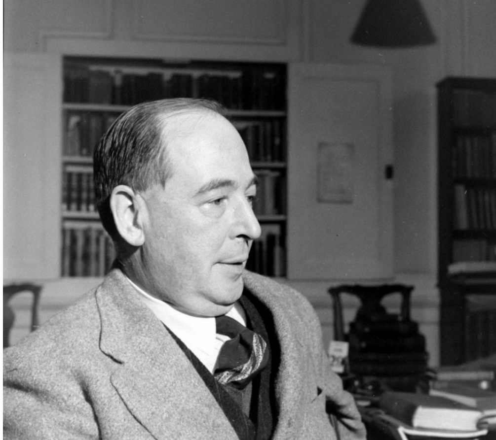
C.S. Lewis 1898-1963

“A man can no more diminish God’s glory by refusing to worship Him than a lunatic can put out the sun by scribbling the word darkness on the walls of his cell.”