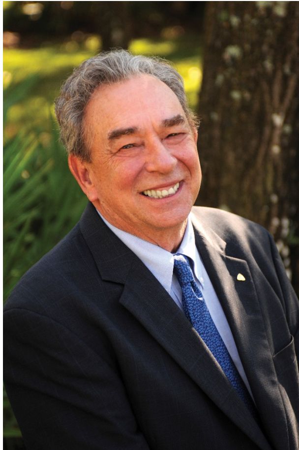
R.C. Sproul 1939-2017

“As Jesus rode into Jerusalem, He was on the cusp of the culmination of who He was and what He had come to do as the supreme Prophet, who would give the clearest revelation of God; the ultimate Priest, who would present the perfect sacrifice; and the almighty King, who would reign forever and ever.”