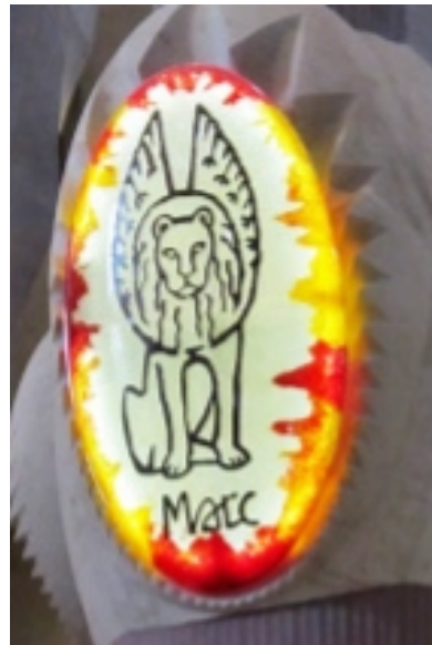
Mark A Winged Lion