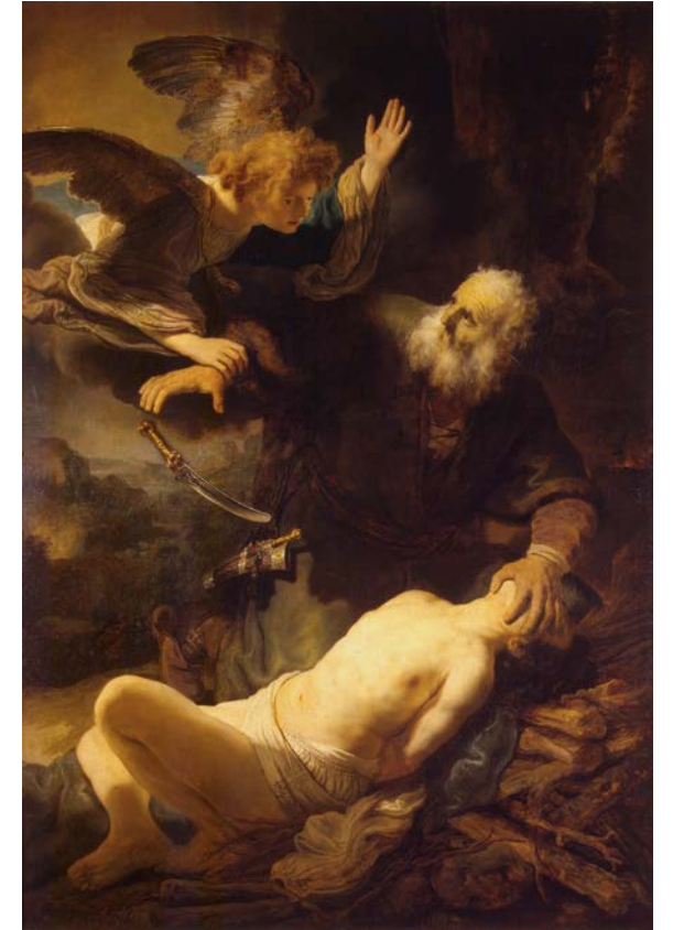
Rembrandt van Rijn