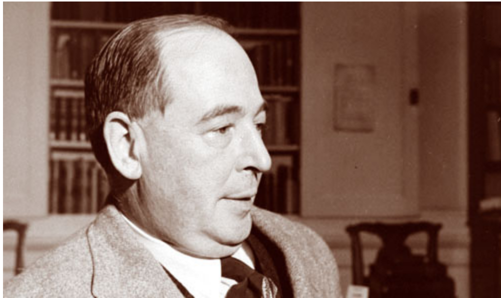
C.S. Lewis 1898-1963

“‘If God were good, He would wish to make His creatures perfectly happy, and if God were almighty He would be able to do what He wished. But the creatures are not happy. Therefore God lacks either goodness, or power, or both.’ This is the problem of pain, in its simplest form.”