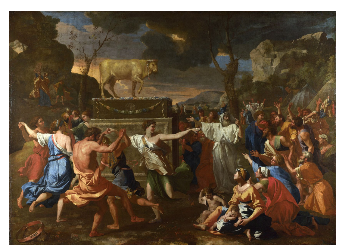
The Adoration of the Golden Calf

Nicolas Poussin (1594-1665) The National Gallery, Trafalgar Square, London