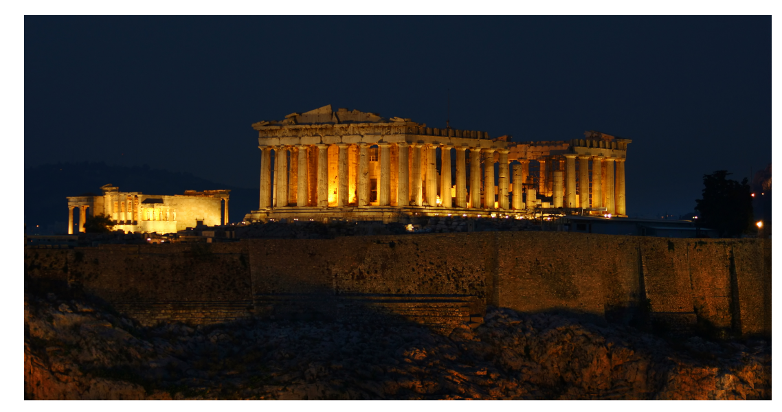
The Parthenon on the Acropolis "The whole of the land are alike sacred to Athena" - Pausanias